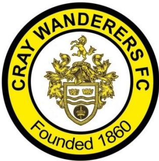
Ryman Premier Cray Wanderers FC