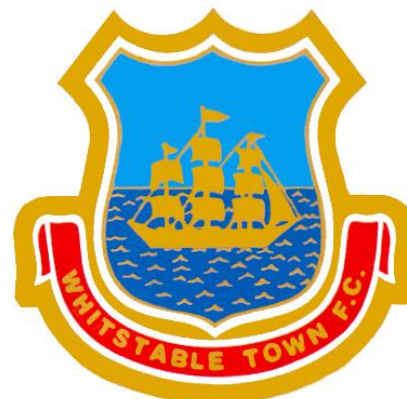
Ryman South Whitstable Town FC