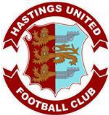
Ryman Premier Hastings United