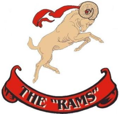
Ryman South Ramsgate