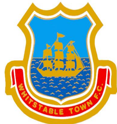
Ryman South Whitstable Town FC